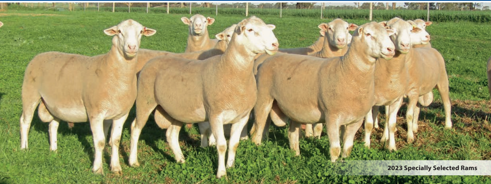
2023 Specially Selected Rams

19th ANNUAL ON PROPERTY RAM SALE Wednesday, 4th October 2023 1pm (Vic)