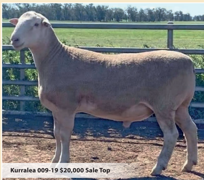
Kurralea 009-19 $20,000 Sale Top