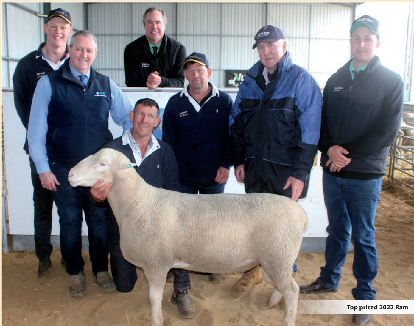
Top priced 2022 Ram