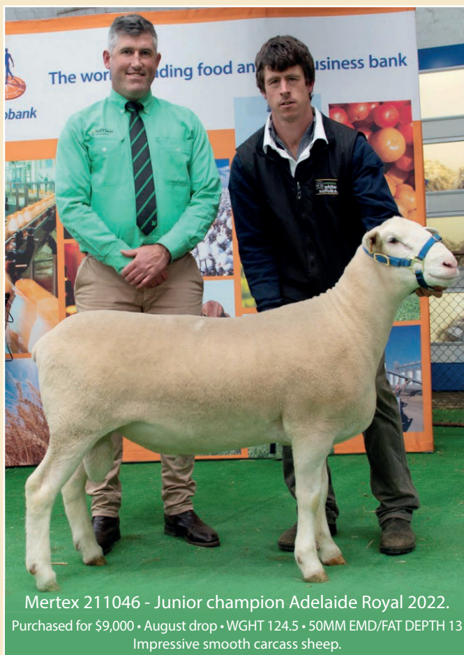
Mertex 211046 - Junior champion Adelaide Royal 2022. Purchased for $9,000 • August drop • WGHT 124.5 • 50MM EMD/FAT DEPTH 13 Impressive smooth carcass sheep.