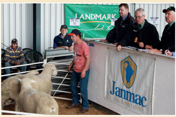
- article supplied by Superior Selections