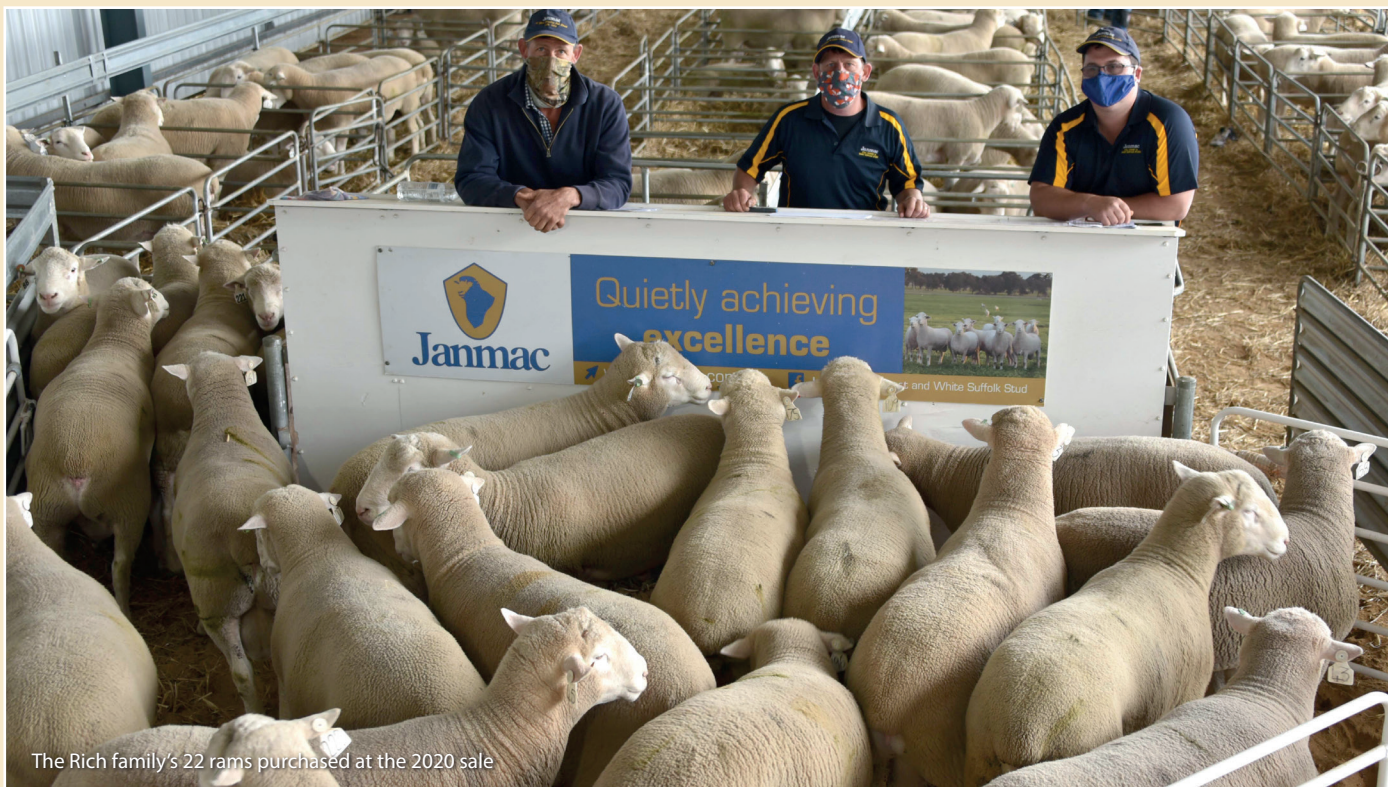
The Rich family's 22 rams purchased at the 2020 sale